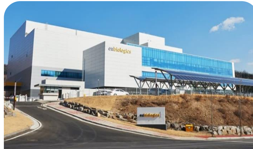
[V-Plant, R&D Center]